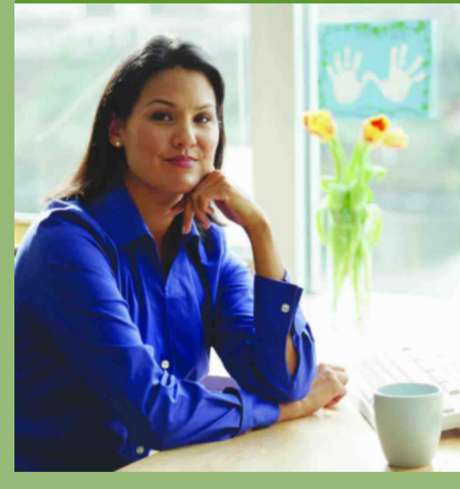
We're Here To Help