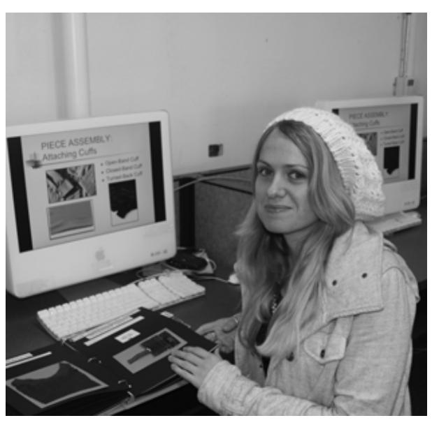
Electives as needed to meet minimum of 60 units required for the degree: Recommended Electives: Fashion 110, 121, 135, 141, 160, 161, 162, 170, 171, 172, 173, 175, 176, 178, 179, 190, 290.

For graduation requirements see Requirements for the Associate Degree on 92.