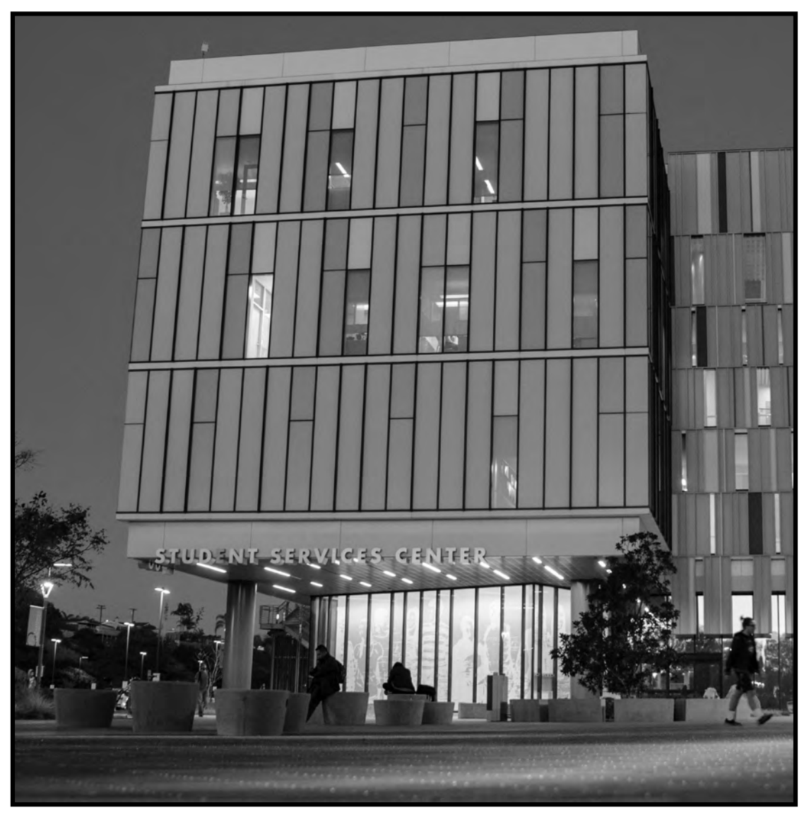
We are Mesa... student access and success