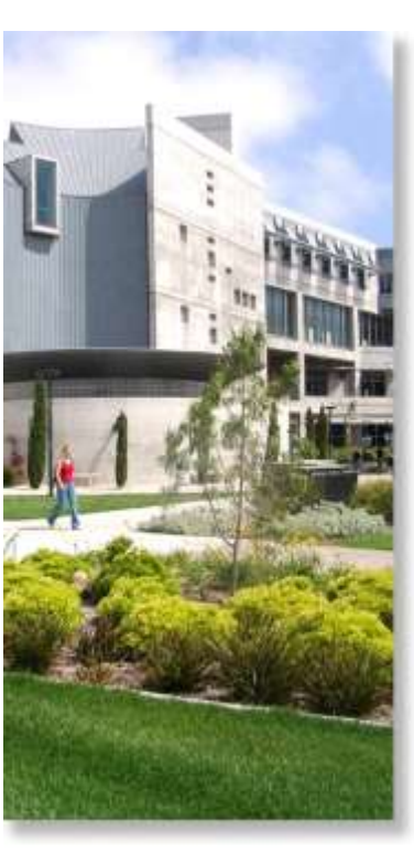
SAN DIEGO MESA COLLEGE