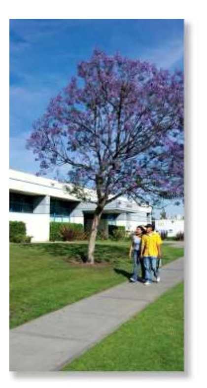
SAN DIEGO MIRAMAR COLLEGE