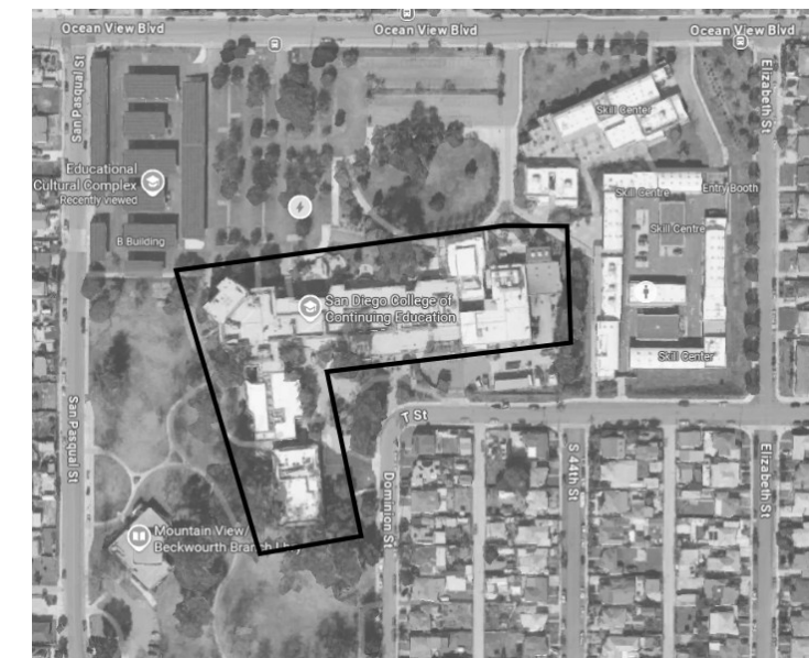
4343 Ocean View Blvd, San Diego, CA 92113