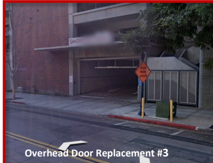
Overhead Door Replacement #3