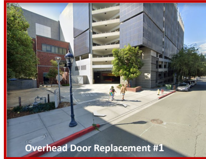
Overhead Door Replacement #1