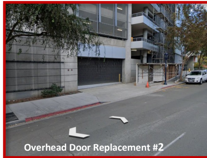
Overhead Door Replacement #2