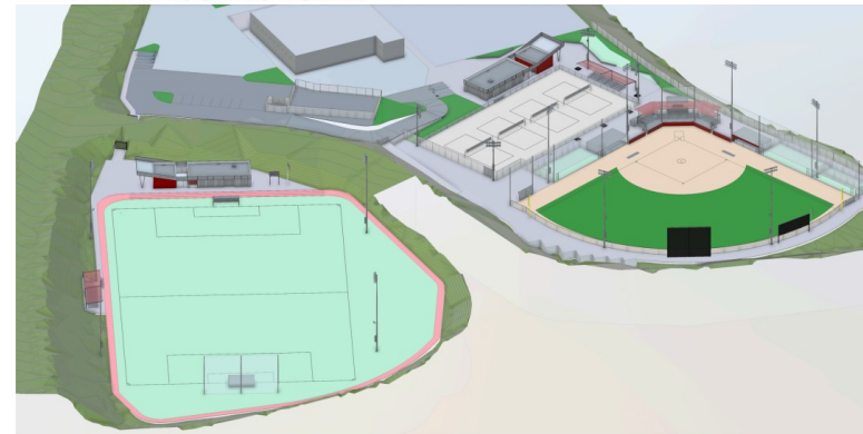
SITE AERIAL LOOKING SOUTH