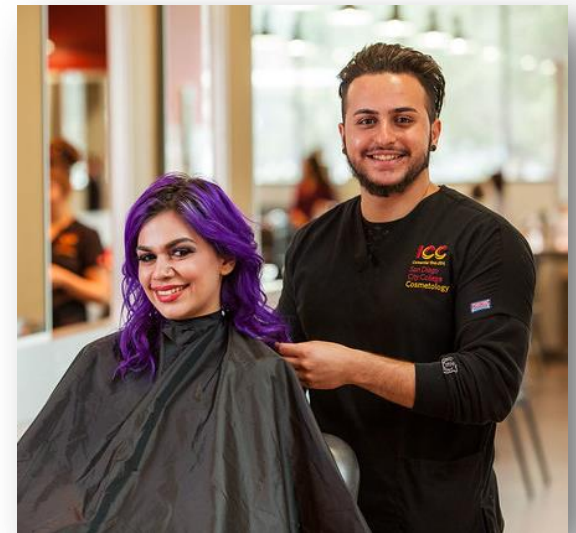
Cosmetology Program San Diego City College