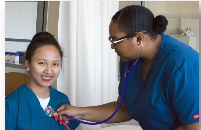
Healthcare Program San Diego Continuing Education