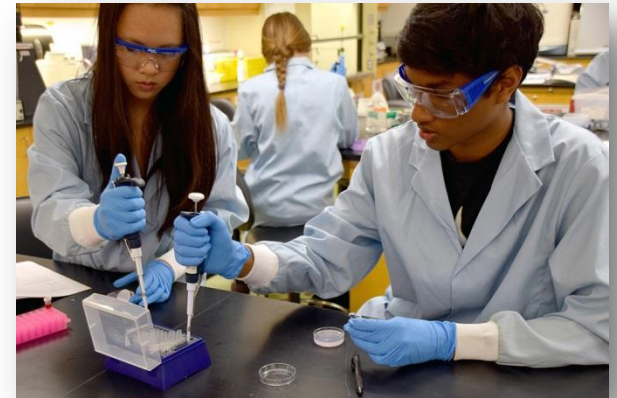
Biotechnology Program San Diego Miramar College