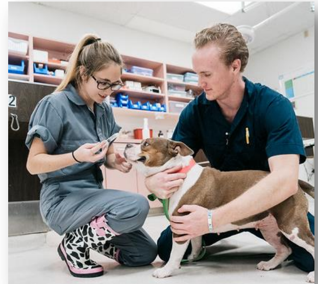
Animal Health Technology Program San Diego Mesa College